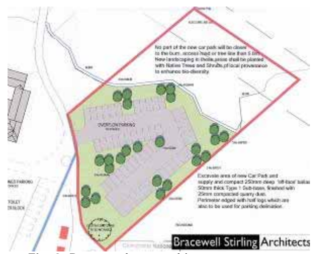
Fig. 3: Proposed car parking arrangement

4. The final element of the development proposal is the formation of an additional car parking area within the Badaguish complex. The overall site area identified for car parking extends to approximately 3,600 square metres (0.35 hectares) and is proposed on the eastern edge of the complex in an area which currently accommodates a spruce plantation. The identified site area is dissected by the Allt Feithe Moire burn which runs through it. The site layout plan shows car parking curtailed to the southern side of the burn, with provision being made for 52 formal car parking bays, arranged in a V shape. Supporting information indicates that a 5-10 metre exclusion zone would be established along the burn adjacent to the car park and that this would be "enhanced by new native tree planting to create an attractive wildlife and landscape feature to provide screening and amenity to the car park."