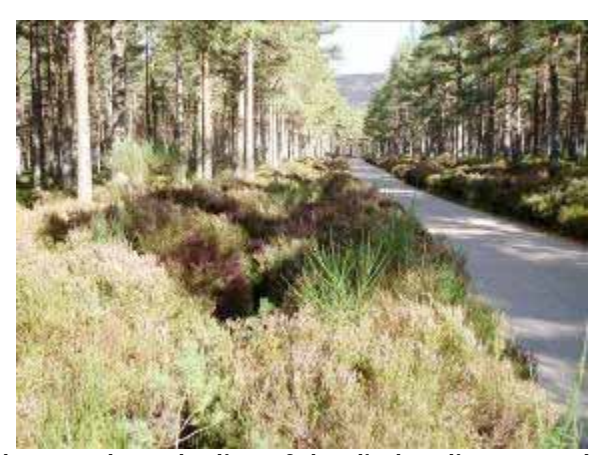
Fig. 2: Proposed route along the line of the ditch, adjacent to the existing single track access road.

3. Three passing places are proposed, all of which would be positioned on the eastern side of the existing access road. The first of the passing places is proposed approximately 250 metres from the junction with the public road, the second is approximately 450 metres from this, and the final passing place is proposed approximately 70 metres from the main area of the Badaguish complex.